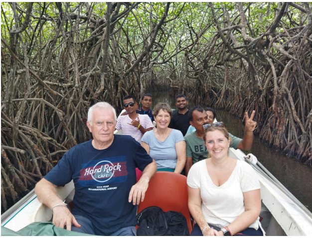
Members of our new club, the FF of Galle, Sri Lanka, met 3 members from the FF of Varel in February