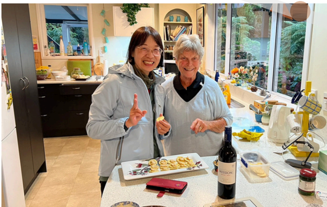
The FF of Hsinchu, Taiwan was home hosted by the FF of Taupo and the FF of Wairarapa, New Zealand in April