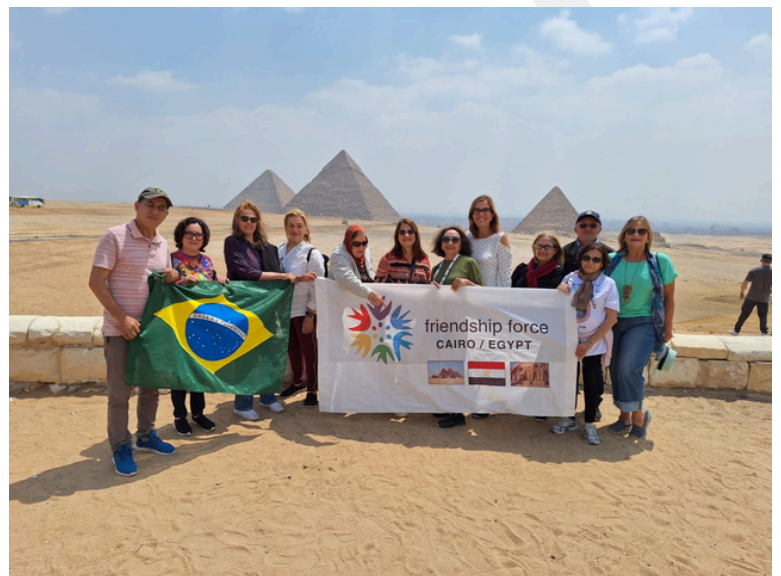
Members from the FF of Belem, Brazil made new friends in Cairo, Egypt in May