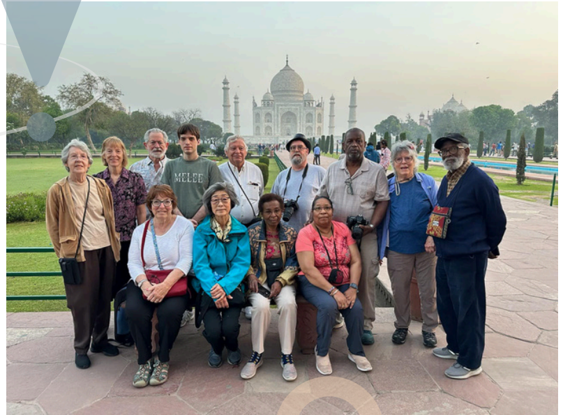
Central North Carolina Traveled to India and Nepal in March