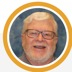
Chuck Goldfarb (2022) Treasurer USA