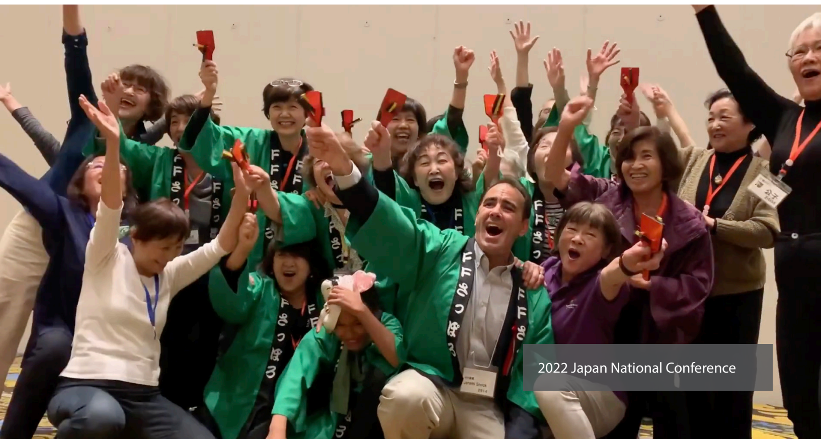
2022 Japan National Conference