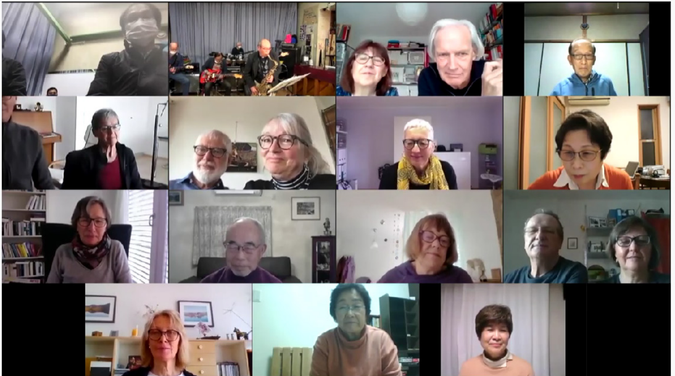
Second Zoom meeting between FF Solothurn (Switzerland) and FF Nara and FF Hiroshima (Japan)