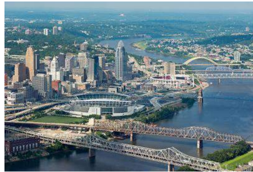
Cincinnati - Midwest on the Ohio River