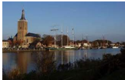
City of Hasselt, Limburg on the Albert Canal