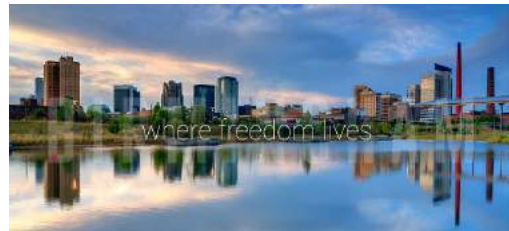
Birmingham, Alabama City Scape

Come join us on this exciting exchange to three areas of America that you may never have seen and places that many travelers may not get a chance to visit. Birmingham, Alabama, Cincinnati, Ohio and the great Oklahoma. We will be spending one week in each of these vibrant cities - all different.