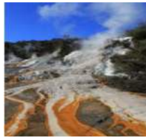
Orakei Korako Cave