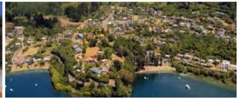
Town of Taupo

The Manawatu region is dominated and defined by 2 significant river catchments, the Whanganui and the Manawatu. The Whanganui River, in the northwest, is the longest navigable river in New Zealand. The river was extremely important to early Māori as it was the southern link in a chain of waterways that spanned almost two-thirds of the North Island. It was one of the chief areas of Māori settlement with its easily fortified cliffs and ample food supplies. Legends emphasise the importance of the river and it remains sacred to Whanganui iwi.