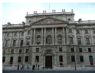
London - The entrance to the "War Cabinet Rooms Museum"

Wander at your leisure along the River Thames