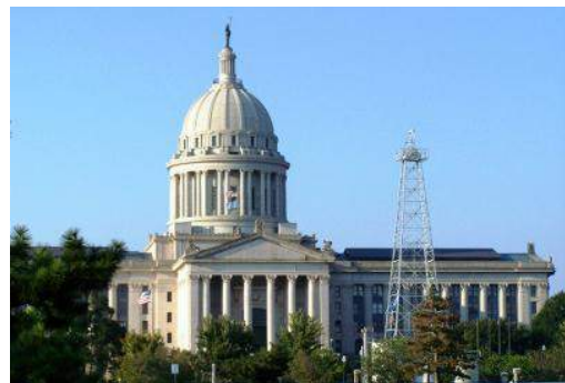
Oklahoma Capitol Building

We are going at a great time of year - May/June so escape the chill and experience this opportunity to see middle America.